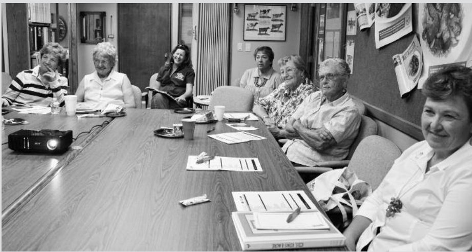
It's not all work! Trainers share a smile during the program.